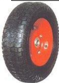
PR3008 Size 6.50-8