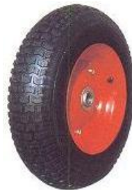
PR3007 Size 4.50-8