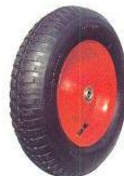
PR2601 Size 3.50-8